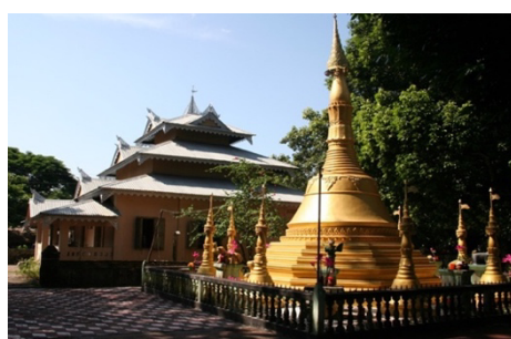
Buddhist Temple at Ramu