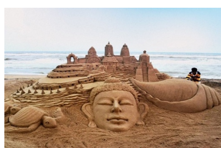
Sand sculpture (made to specification) at Cox's Bazaar Beach