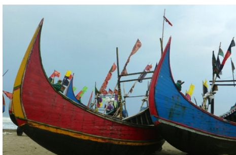
Sea-beach at Teknaf with rows of colorful fishing boats

Site-specific performance: Nrityajog will provide logistic support team, including videography, so that the performance can later be viewed during our Digital Dance Session.